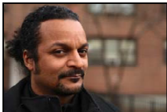
COVER DESIGN: Miriam Ahmed COVER ART: Jean-Michel Basquiat, Boy and Dog in a Johnypump, 1982 © The Estate of Jean-Michel Basquiat / ADAGP, Paris / ARS, New York 2013

July 2013 | 164 pp. | 6" x 9" Trade Paperback | $18.95 ISBN-13: 978-0-9884-763-5-6 (pbk.) LCCN: 2013933165